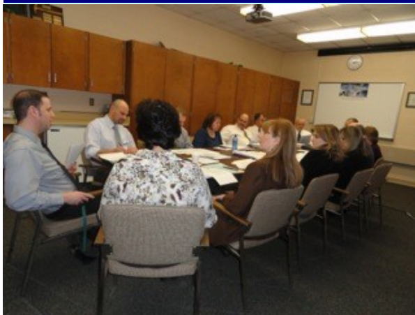
ISO Management Quality Team members participated in the required annual ISO Management Review.

The GACTC Quality Management Team (QMT) met in a Management Review session on January 9-10, 2012. As required by the ISO 9001 standards, the QMT must meet in a Management Review session annually to review the school's Quality Management System. The inputs to Management Review include information on: results of audits, customer feedback, process performance, status of preventive and corrective actions, follow-up actions from previous management reviews, changes that could affect the quality management system and recommendations for improvement. Management Review also serves as a platform for the exchange of new ideas, with open discussion with QMT representatives.